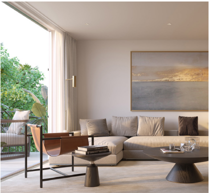
PERLA Striking and versatile, with richly stained hardwood floors, bright bathrooms and sleek kitchens.