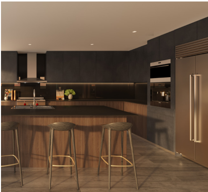
NOIR Steeped in dramatic tones and crafted with natural materials and pristine detailing.