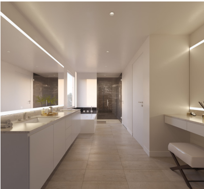
LUMINAIRE Timeless materials complement the streamlined design and sophisticated, light-filled interiors.