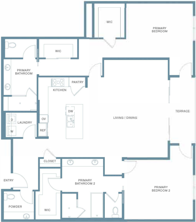
SECOND OR THIRD LEVEL

EtcoHomes.com/TheAinsley • info@EtcoHomes.com