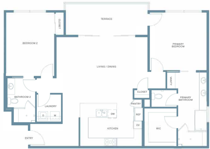
SECOND OR THIRD LEVEL

EtcoHomes.com/TheAinsley • info@EtcoHomes.com